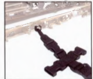
4. Attach to harness