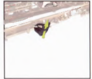
2. Thread the Quick Disconnect through loop