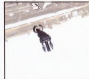
3. Tighten knot