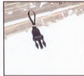
1. Thread loop through strap ring.