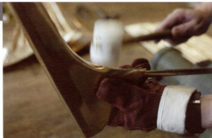
Hand hammered bell