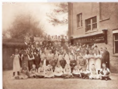
Boosey & Hawkes's factory