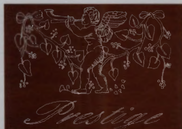
Original Prestige engraving