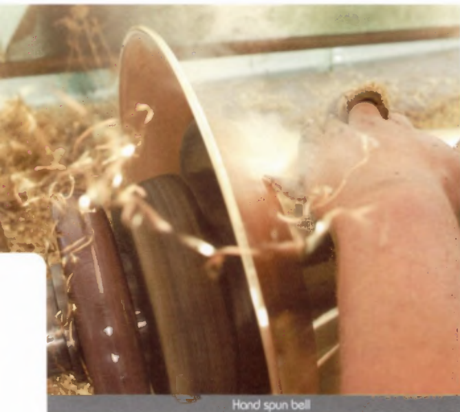
Hand spun bell

To guarantee the quality standards, new tooling has been built by the laser measuring of Prototype BESSON instruments including the Imperial , New standard , early Sovereign and new Prestige models. This precise measuring ensures the exact dimensions of each component part and guarantees that the exact, original design of each model has been respected fully.